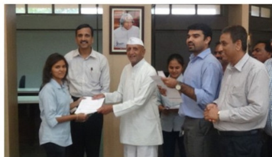
Distribution of Offer Letters to 41 KPIT select students by Hon. President Shri. Balasaheb Wagh