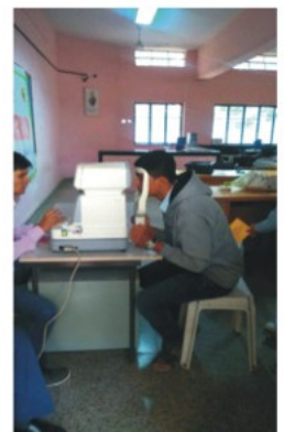
Free Eye Check-up Camp