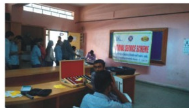
Free Eye Check-up Camp